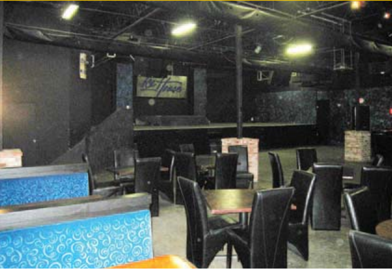
Separate Performance Area