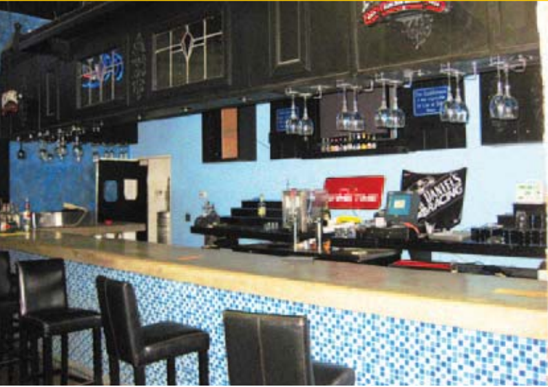
First Bar Area